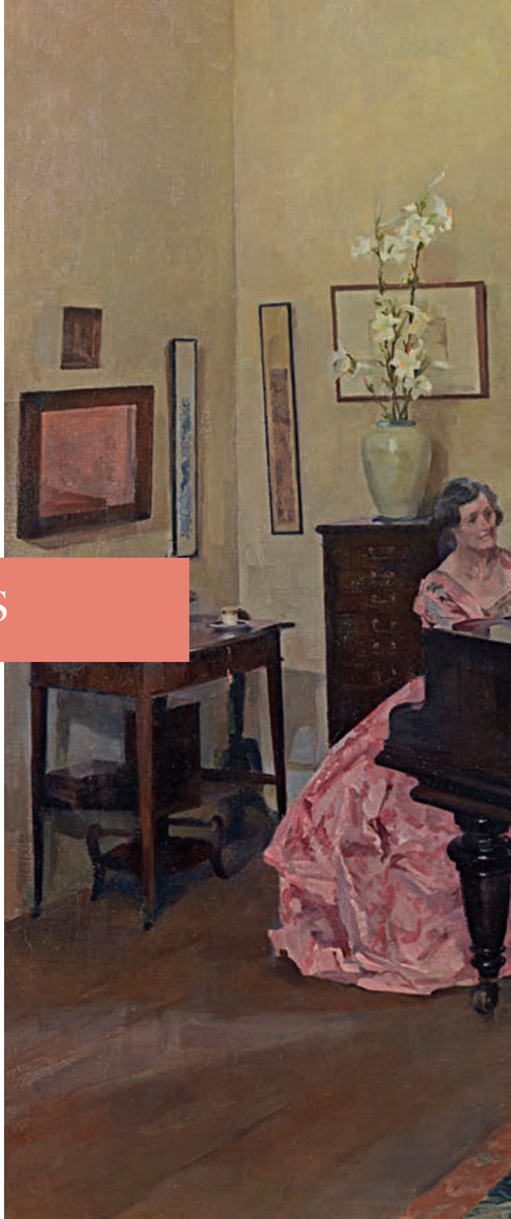
ANNA AIRY Spring song (detail, cat. no.11)